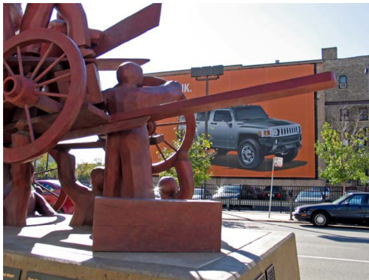
Haymarket Monument with a billboard advertising Hummer’s H3.

By the late 1990s, however, Chicago was a very different city than it had been a generation ago. The mayoral administration of Richard M. Daley (son of Richard J. Daley, mayor during the 1968 Democratic Convention and the Weatherman bombings) was intent on remaking the image of Chicago as a green postindustrial metropolis for the educated and affluent (Chamberlain, 2004). As Lara Kelland noted, “Chicago of the 1990s faced entirely different challenges than it did earlier in the twentieth century. Gentrification brought a middle-class base back into the city after a generation of white flight, and heritage tourism also now offered a tantalizing revenue stream to city leaders” (Kelland, 2005, 35). Combined with a post-ideological climate exemplified by the presidential administration of “New Democrat” Bill Clinton, the political landscape seemed ready for a monument that would both emphasize and forge reconciliation and consensus.